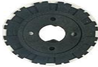
6 X MIDI WHEELS