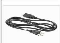
15V POWER CORD